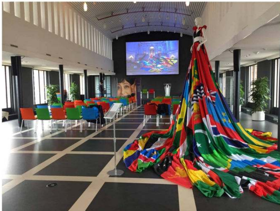
Ready for the symposium on Coming Out Day 2017 @ the Ministry of Economic Affairs

During Coming Out Day 2017, the Amsterdam Rainbow Dress was presented at the Ministry of Economic Affairs in The Hague, The Netherlands. The Amsterdam Rainbow Dress was exhibited for a number of days and the Foundation participated in an afternoon program that focused on diversity.