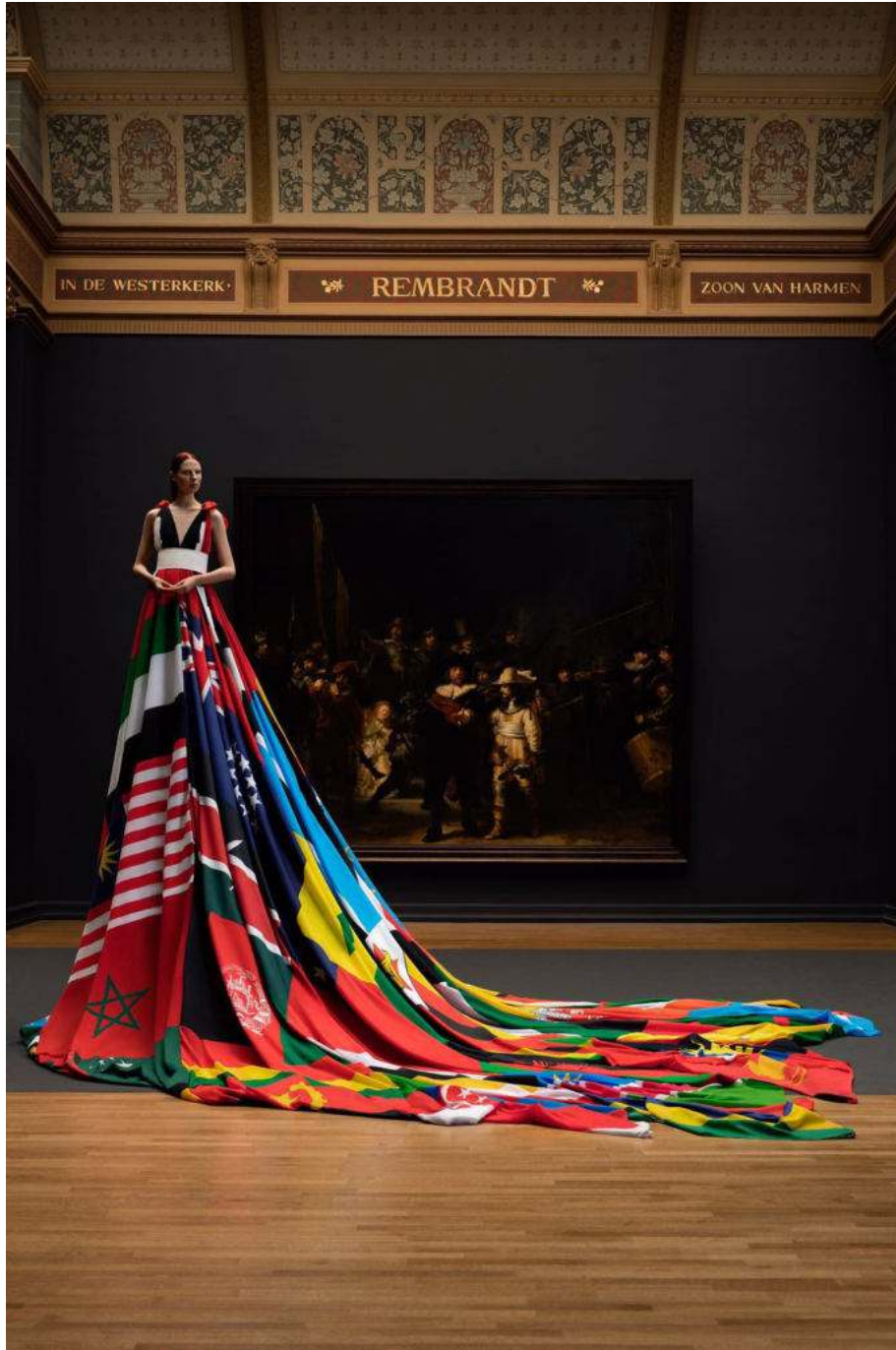
model Valentijn de Hingh - Rijksmuseum Amsterdam - Amsterdam Rainbow Dress Foundation 2016

In August 2016, the Amsterdam Rainbow Dress was presented and captured in spectacular images. The magnificent publicity images by acclaimed photographer Pieter Henket show top model, trans woman and LGBTI+ activist Valentijn de Hingh wearing the monumental dress at the Rijksmuseum's Gallery of Honor in front of Rembrandt's Night Watch.