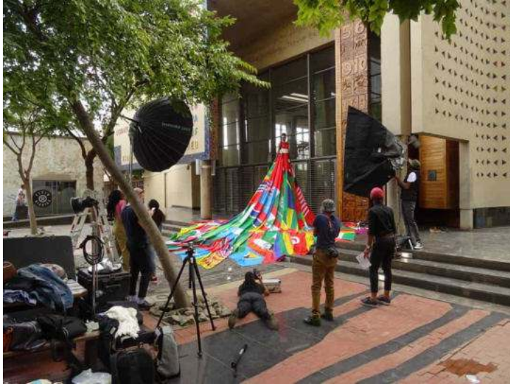
Preparing for the photo shoot @ Constitution Hill Johannesburg

At the invitation of the Dutch embassy in Pretoria, we presented the Amsterdam Rainbow Dress at Constitution Hill in Johannesburg during International Human Rights Day on December 10. We were part of a discussion program on LGBTI+ rights at the Dutch Embassy in Pretoria. Finally, we presented the Dress in Cape Town at the MOCAA museum. Here, we also participated in a substantive program on LGBTI+ rights. Of course, we also expanded our art photography series with the first photos on the African continent.