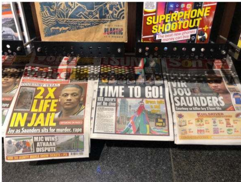
On the front page of the South African newspaper Daily Sun

During our stay, we spoke about the dress and our mission on several television and radio shows, and the dress was shown on the front page of the Daily Sun, one of the main newspapers in South Africa