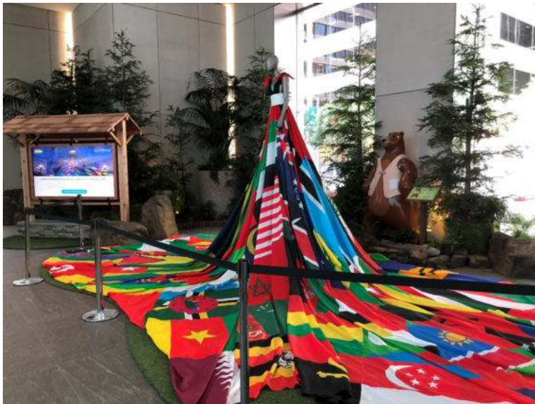
Presentation @ Salesforce Headquarters San Francisco