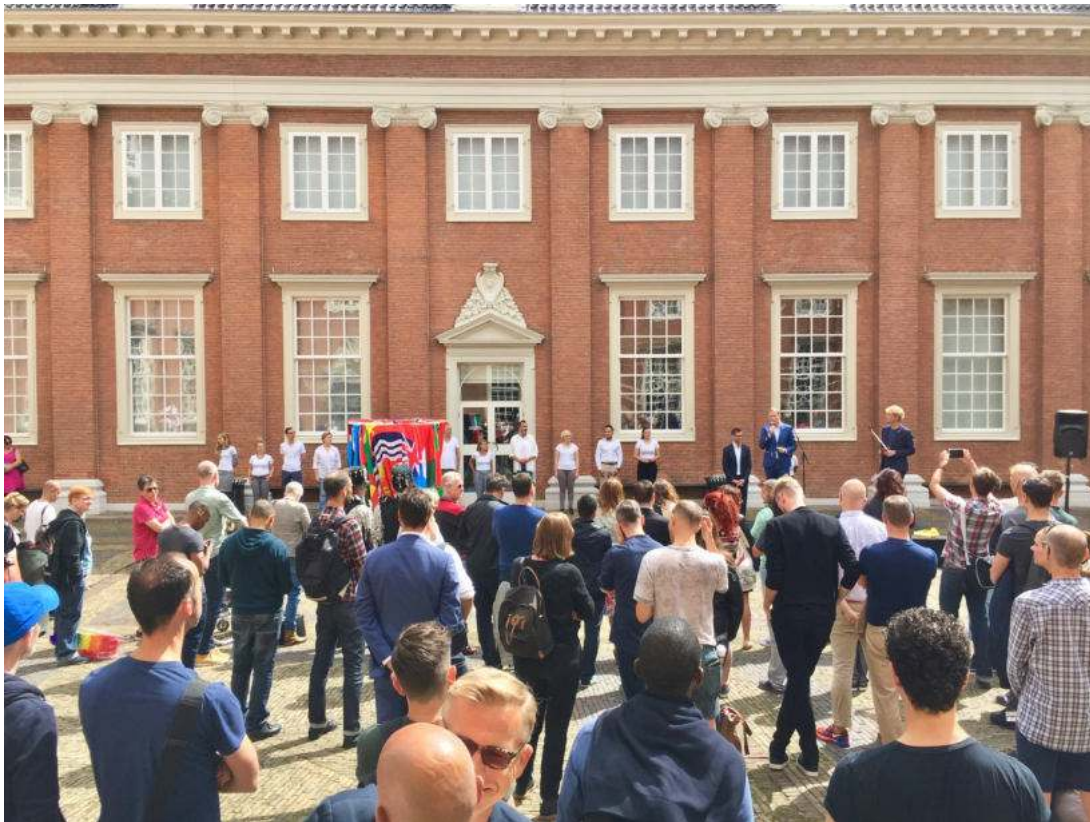
A few moments before the unveiling of the Amsterdam Rainbow Dress in the courtyard of the Amsterdam Museum – August 5, 2016

The first presentation of the Amsterdam Rainbow Dress was on Friday, August 5, 2016, in the courtyard of the Amsterdam Museum, in front of a large crowd of LGBTI+ people, including LGBTI+ refugees, and the press. The presentation was part of the Shakespeare Club event that took place during Amsterdam Pride in the Amsterdam Museum to commemorate the 70-year jubilee of COC, the oldest LGBTI+ organization in the world, which was established in 1946.