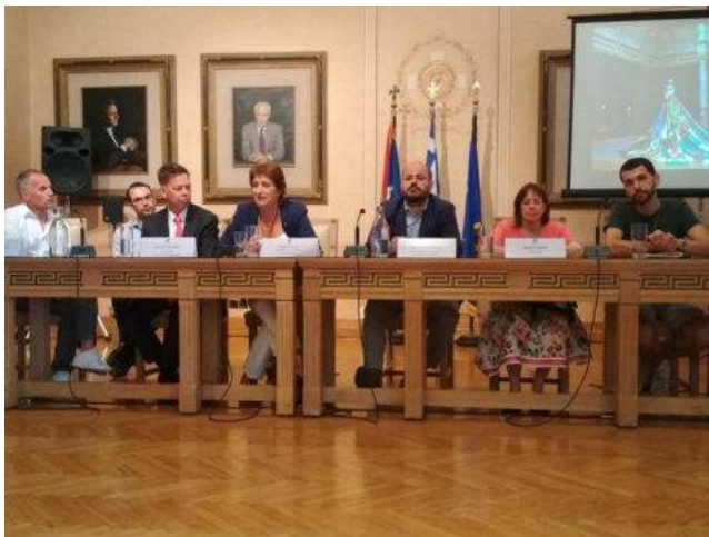
Press conference in Athens

A very important part of the work of the Amsterdam Rainbow Dress is the communication relating to the dress and what it stands for. Therefore, all exhibitions of the dress are accompanied by talks, conferences, explanations and meetings with local LGBTI+ persons.