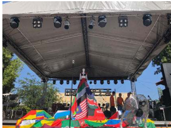
Athens Pride 2018 presentation at the Conference and on the Main stage