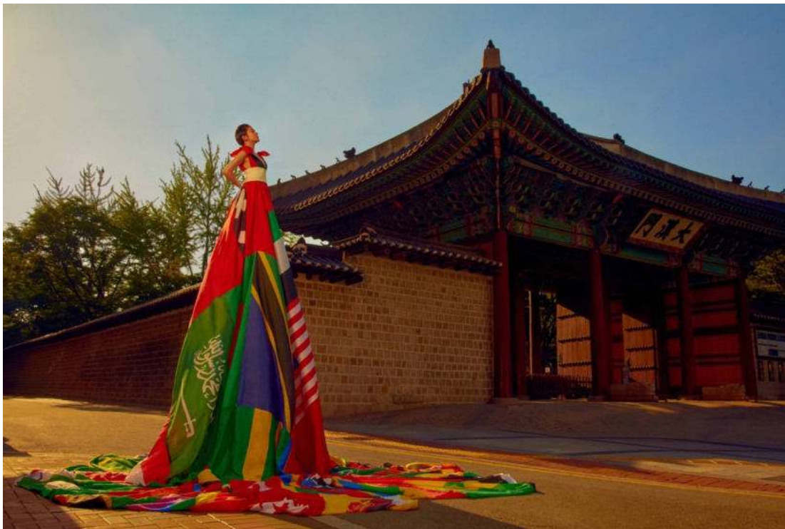
model Boss Mi – in front of Deoksugung Palace, Seoul – Amsterdam Rainbow Dress Foundation 2019