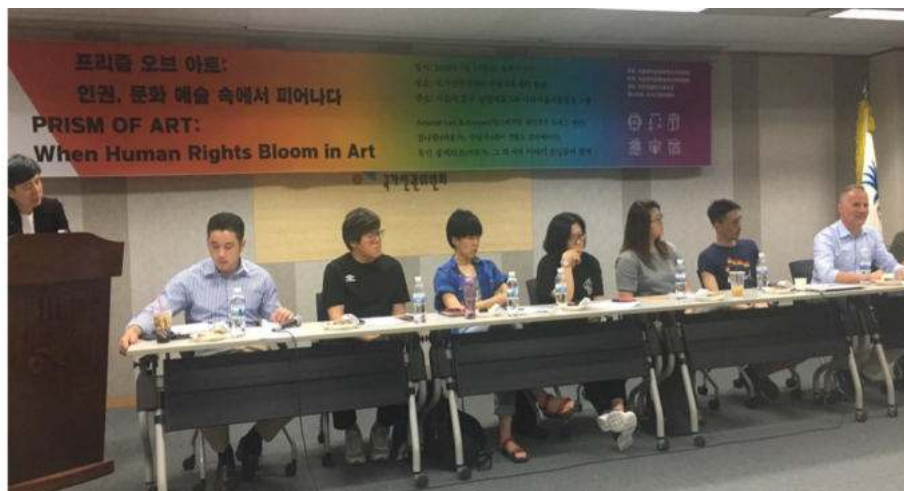
Press conference in Seoul