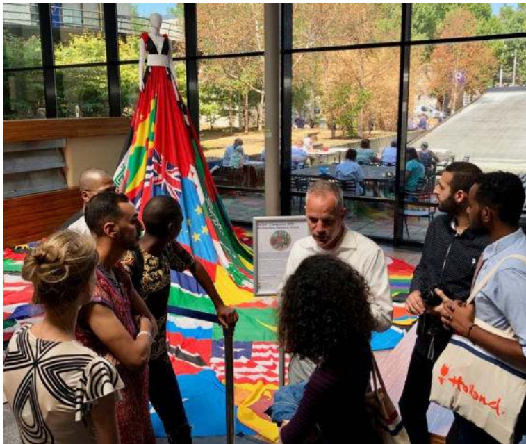
During the week in the OLVG a group of international LGBTI activists was welcomed to see the dress and hear the story behind it.