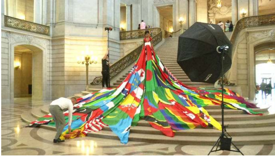
Preparing the Amsterdam Rainbow Dress for the photo shoot on the stairs of San Francisco City Hall

The Hague The Netherlands, October 11, 2017