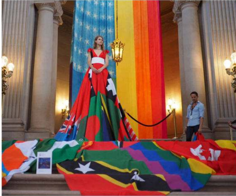
VIP Party @ San Francisco City Hall during Pride 2018

The organization of San Francisco Pride joined forces with the Consulate General of The Netherlands in San Francisco to make it possible for us to spread our message again in San Francisco. We presented the Rainbow Dress at Salesforce headquarters and during the VIP party in San Francisco City Hall