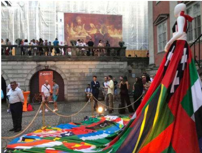
In the Courtyard of the Embassy of the Netherlands in Stockholm during the Human Rights Conference.

On the 3 rd of August, the Amsterdam Rainbow Dress was presented during Euro Pride 2018 in Stockholm as part of the program of the Embassy of the Kingdom of The Netherlands. Presenting during Euro Pride was special because in 2016 the Amsterdam Rainbow Dress was created during Euro Pride in Amsterdam.